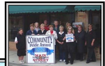
Community Pride Award